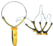
Small Hot Wire Tools

See a wide range of foam cutting equipment at CraftersHotKnife.com or call TL Marshall Company's Foam Cutting World 800-856-1009