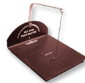
Mini Hot Wire Tables