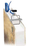
SIP Panel Groover