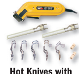
Hot Knives with Detachable Blades