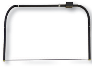
4" Big Bow Hot Wire